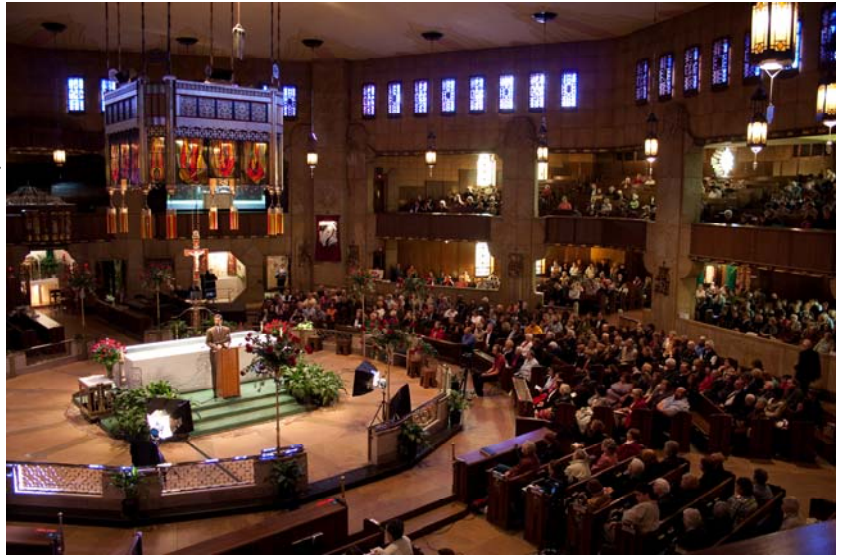
Call to Holiness 2009 was attended by 1000 people at the National Shrine of the Little Flower.