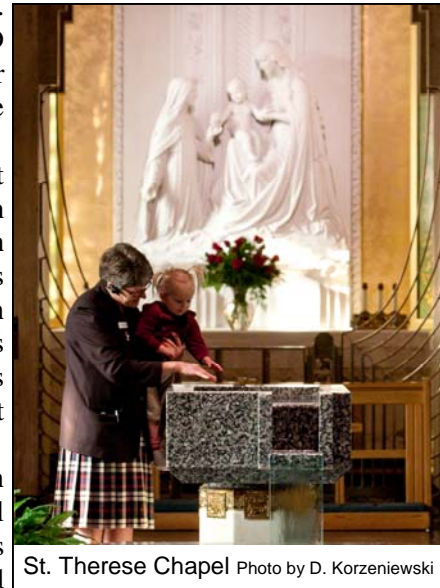
St. Therese Chapel