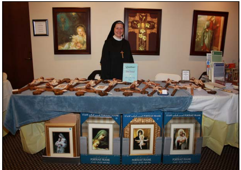
The hand made crucifixes and framed religious art were available from the Holy Cross Sisters at the 2009 CTH conference.